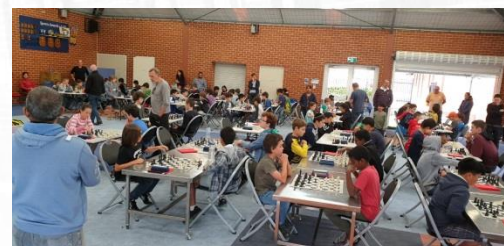
Competition was tough on the top boards