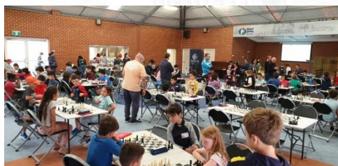
The event was well attended