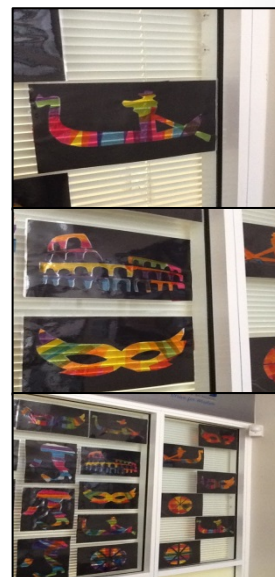
Above: Stained Glass window art created by Pre-Primary Classes