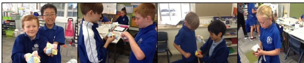
Left: Room 6 making Italian Chatterboxes about the weather