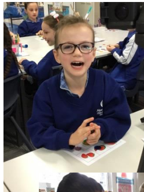
Photos: Some of the Year 1 students playing Tombola (bingo) and role playing shopping for fruits and vegetables.